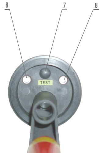
Contact electrode 3.6 - 38.5kV